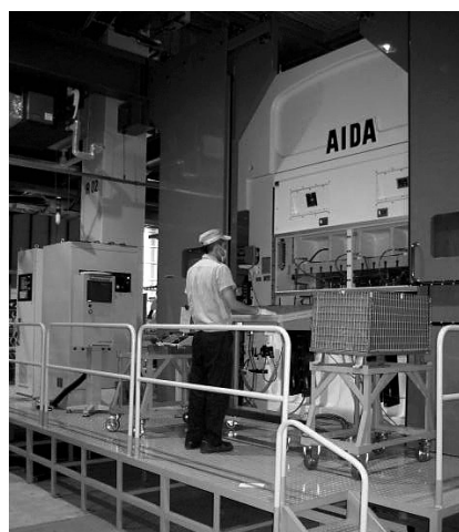
Photograph 1: 300 ton press

In order to handle large model developed products and multiple processes on the specification side of a pressed product, a 300 ton pressing machine (photograph 1) has been added to the existing press power, which consists of ten 50 to 200 ton pressing machines. With this support, all of the pressing on manufactured products can be performed internally at Kangawa works. This eliminates the separation process and the transport of pressed products, which in turn improves productivity and greatly