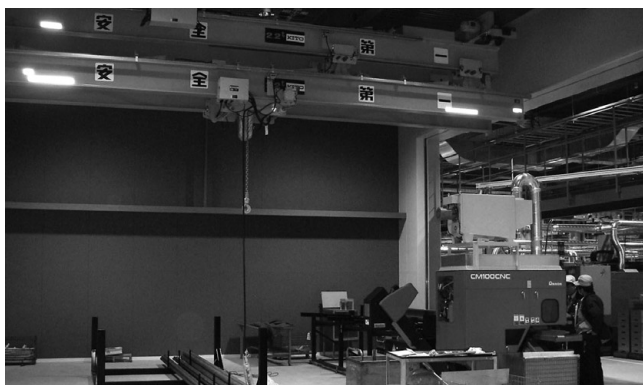
Photograph 3: Circular saw for shaft cutting

With the new facilities at Kangawa Works, new cutting machines (CNC circular saw (photograph 3) and CNC band saw) and high-frequency quenching machines (two