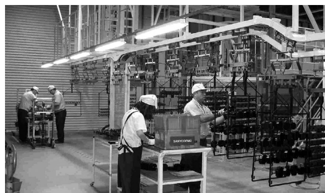
Photograph 5: Cation electrodeposition coating device

The applicable targets for coating are iron and aluminum, while the size can range from a very small size to a large model. From a technical standpoint, it is very difficult to ensure coating quality with only a single device. Therefore, from the initial planning stage, we collected information about equipment or coater manufacturers and the equipment specifications, and we decided to install a cation electrodeposition coating device (photograph 5). Since we are able to handle cation electrodeposition coating internally, we can achieve stable quality in terms of coating