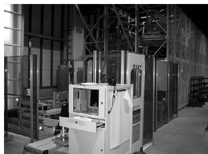
Photograph 2: Stand-alone automatic depository