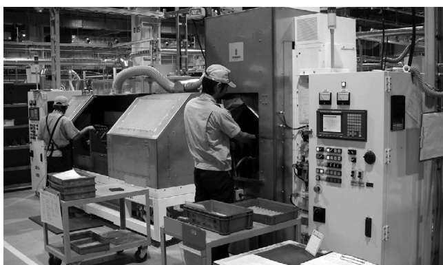
Photograph 4: Shaft high-frequency heat-treating device

different sizes, photograph 4) were installed.