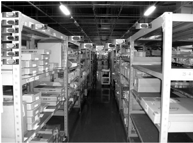
Photograph 6: Parts warehouse guidance system